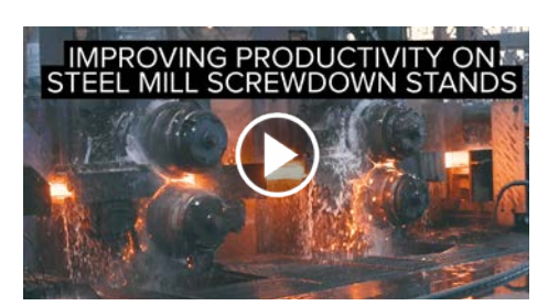
Delroyd Drives for Screwdown Mill Stands

Ameridrives Bauer Gear Motor Bibby Turboflex Boston Gear Delevan