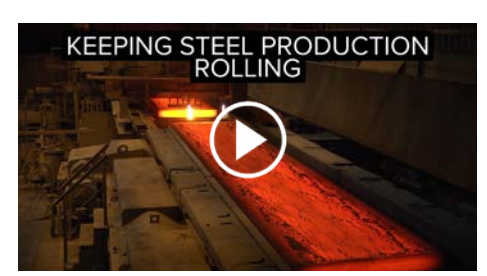
TB Wood's Couplings for Steel Mill Runout Table