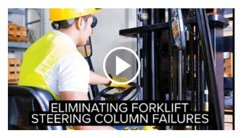
Huco Couplings for Forklift Steering Columns