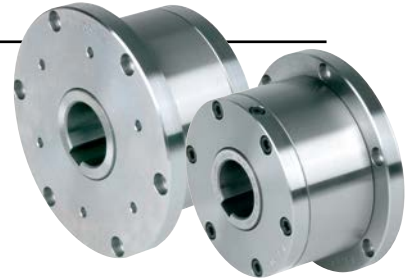
Back of AL..F2D2