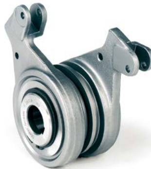
Indexing clutch and backstop combination for high voltage switch-gear