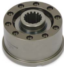
Overrunning clutch for multiple drive applications in construction machinery