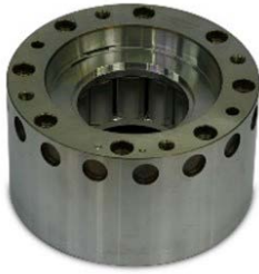
Stainless steel backstop in a power station

Stieber realizes customer specific designs from minor modifications of a standard product up to tailor-made solutions in batch size one