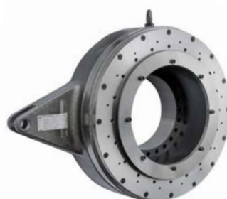
Torque limiter as overload protection in a marine application