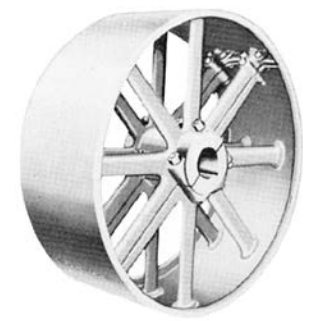
Split Thru Arm

B5-4 TB Wood's 888-829-6637 P-1686-TBW 11/15