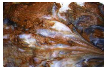
Typical example of internal bearing corrosion resulting from water ingress.

The splash guard is installed between the crank shaft or ground drive hub shoulder and the inner race of the clutch top bearing.