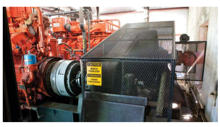
The photo above shows a Wichita clutch (left), TB Wood's sheaves and belts (center, under grated guards), and an Ameridrives U-Joint (far right).