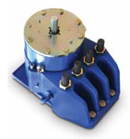
Twiflex VKSD-FL caliper brakes.