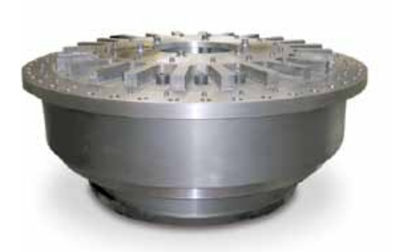
The unique Wichita HBS 42-14 wet brake uses oil shear technology as the torque generator and does not wear or create dust like a dry friction brake.

In March 2007, the 27 EU Member States adopted a binding target to obtain 20 percent of its total energy requirements from renewable sources by 2020. In January 2008, the European Commission drafted a Directive on the promotion of the use of energy from Renewable Energy Sources (RES) which contains a series of elements to create the necessary legislative framework for making 20 percent renewable energy a reality.