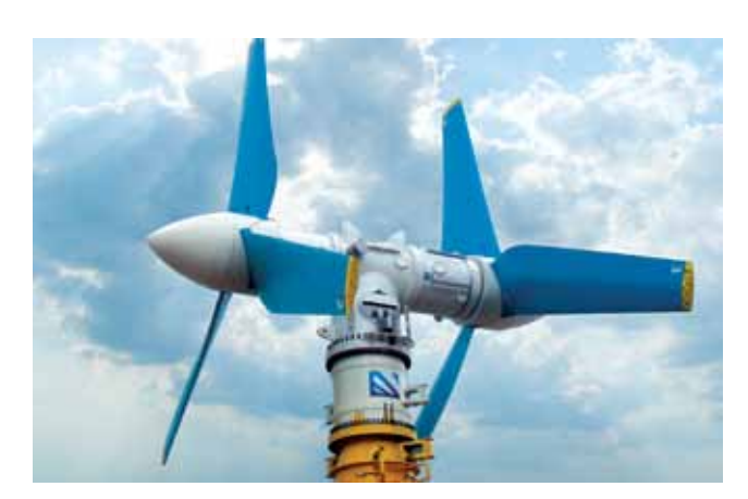
Atlantis AK-1000 1MW Tidal Turbine.