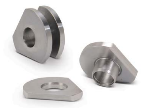
Altra coupling brands have developed the Tri-Bushing™, a unique flex element/blade triangular bushing design that increases the axial capability of high performance flexible disc couplings used in turbomachinery applications.

Revolutionary advancement in disc technology improves high-performance coupling reliability.