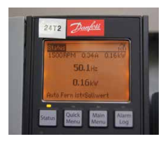
Bauer has developed relationships with many of the leading manufacturers of speed control solutions to work hand-in-hand with its products, maximising the efficiency of its solutions.