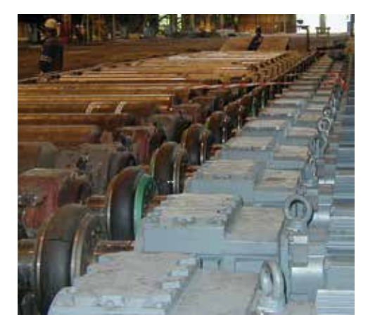
Bauer supplies electro-mechanical application solutions that guarantee every component is hand-picked for the application, and integrated as efficiently as possible.

Thanks to its completely modular design, Bauer's standard product range offers thousands of potential drivetrain packages while, for more specialized applications, the Bauer Specialist Serial Demand service can build a completely custom design which is integrated into the machine from the ground up. Its engineers work to maximise the potential energy savings at every stage of specification and installation to deliver the best possible solution for each individual application.