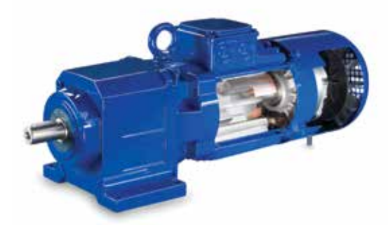
Not only does Bauer already conform to IE2 and IE3 classification, it is also leading the way in new IE4 technology.