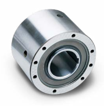
Model FSO 800 clutches have a torque capacity of 13,000 lb.ft. (17,680 Nm). Units are grease-lubricated with steel labyrinth seals and feature PCE sprags with Formchrome® and Formsprag "Free-action" retainers.

The Mount Washington Cog Railway in New Hampshire has been transporting visitors to the summit, 6,288 ft. above sea level, since 1869. The 6-mile, 3-hour round trip features an average grade of 25% (some sections approach nearly 38%).