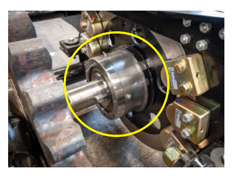
The compact 10 in. diameter FSO units fit within the existing hardware and the small space available. The sprag clutch is engaged for the up-mountain portion of the trip, preventing any roll-back of the passenger coach. For the down-mountain leg of the trip, the clutch is disengaged to allow downward movement.