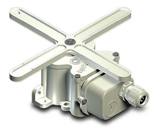
Stromag is also introducing a new variant of its LightXcross LX® crossbar Geared Cam Limit Switch, which offers full monitoring capabilities of cross and long travel in crane applications.

By engaging in technical dialog with end users, Stromag can adapt its comprehensive portfolio of geared cam limit switches to exact application requirements. The results are increased precision, reliability, adjustability and performance. This is supported by a selection of accessories such as encoders and sensors, which provide the increased intelligence end users of critical systems require for seamless operations.