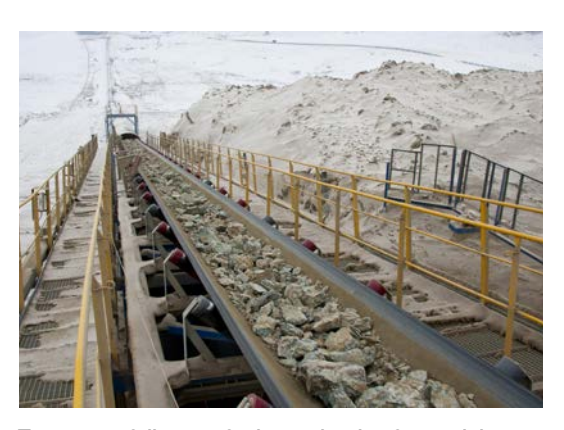
To successfully transfer heavy loads of materials over long distances, mine conveyors need reliable and responsive braking systems.

In addition, Svendborg Brakes has a large installed base of SOBO iQ braking control systems on mine conveyors around the world. This experience has allowed the company, to create a comprehensive and up-to-date data warehouse. This can be accessed by the company's global network of service technicians every time a new control system is installed or commissioned. Once SOBO iQ is set up and the algorithms adjusted, not subsequent fine-tuning is required.