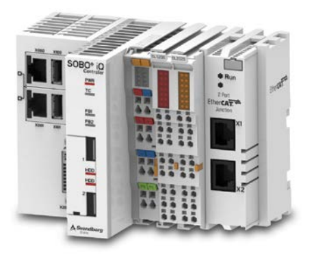
The SOBO® iQ solution from Svendborg Brakes uses controllers based on proportional integral algorithms. By combining proportional and integral responses, the controller is able to handle the fast dynamics of the braking process in a highly efficient and reliable way.

Closed-loop braking system controllers receive one or more reference signal from sensors associated with the conveyor, such as the conveyor's torque, speed and/or pressure. The controllers compare the data received to pre-defined setpoints, the results of which trigger a proportional corrective change to adjust the motion of the conveyor accordingly.