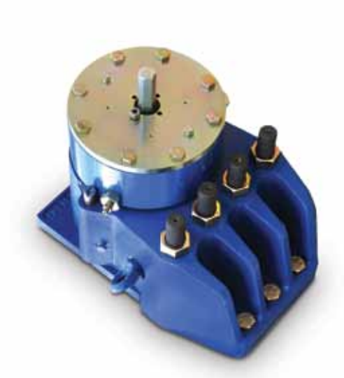
Twiflex VKSD-FL caliper brakes

Twiflex delivers a complete braking solution for Neptune's Proteus