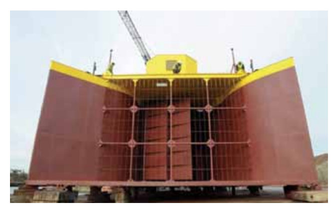
Designed to generate power in nearshore estuaries, the Neptune Proteus 1000 is controlled by a pair of Twiflex VKSD-FL caliper brakes and hydraulic powerpacks.

Twiflex VKSD-FL 'floating' disc brakes have been installed on the large Proteus tidal turbine designed and built by Neptune Renewable Energy Ltd., which was formed in 2005 to develop intellectual properties in both tidal stream power and wave power projects in the UK.