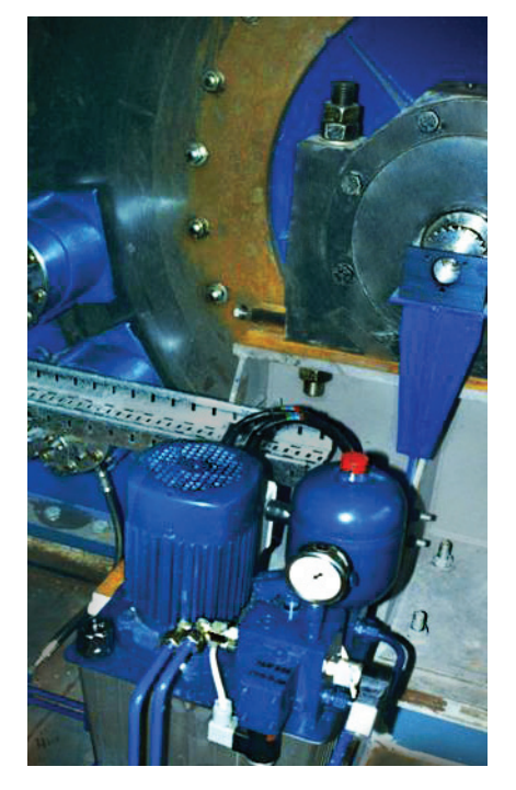
Typical Emergency Braking System showing calipers and hydraulic power pack

An alternative to an overspeed switch is a "mis-matched" control which constantly monitors the hoist motor speed relative to the drum speed. The ratio of these speeds will always be constant parameters determined by gear backlash.