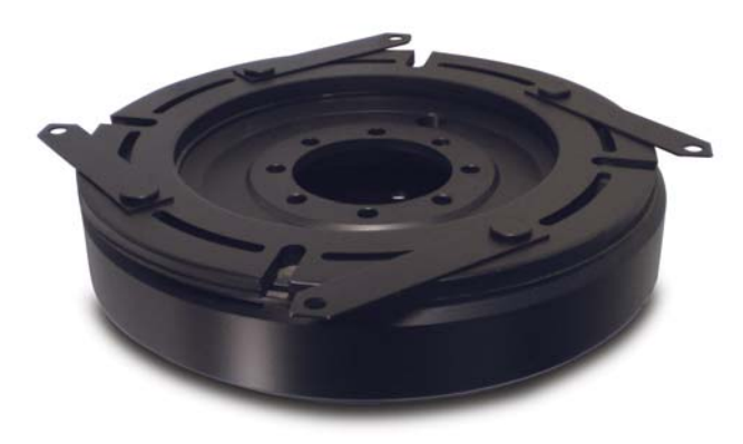
Warner Electric Model SF1000 Clutch

When cutting sections of a roadway with a heavy-duty, dieselpowered concrete saw, the blades and machine must safely and powerfully work together with the material being cut. But occasionally, thermal expansion of the concrete causes the blade to pinch in the kerf of the cut.