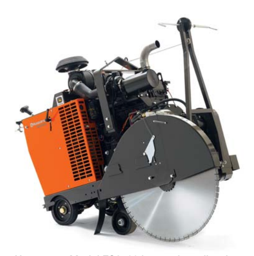
Husqvarna Model FS8400 heavy-duty, diesel-powered concrete saw

The clutch is supplied in three pieces and Husqvarna mounts the parts into the drivetrain during saw assembly. The field coil attaches to the stationary gearbox. The armature attaches to the engine flywheel. And the rotor attaches to a hub wheel, which is attached to the input shaft.