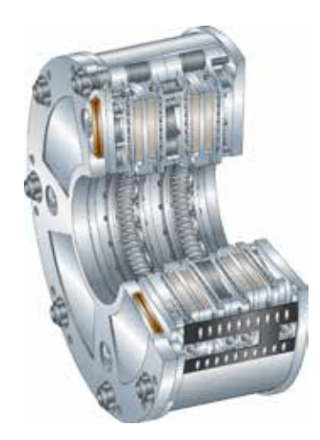
The AquaMaKKs series of brakes from Wichita are well known for offering a simple design which performs reliably in high torque applications in harsh environments.

Whether a project is large or small, most products with this type of large power transmission system are custom manufactured to a greater or lesser degree; though often based on an existing design. Proper consultation is absolutely essential and, if the engineers are designing to a specification, then it is always best if they can be involved in forming that specification.