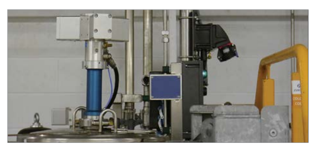
A number of automotive manufacturers have adopted Huco Dynatork Air Motors to drive the agitators in their paint shops.

To achieve this speed consistency with an electric motor you would need an expensive variable-speed drive that requires on-site installation, programming and commissioning.