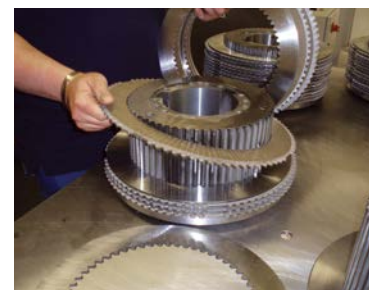
HC/CH clutches feature extra thick plates combined with high performance friction materials.

Most unique to this HC/CH clutch is the incorporation of the Patent Pending Key Seal . This innovation allows for the use of standard O-rings and improves the ease of installation in current configurations using a double keyway and single drilled actuation hole. This feature simplifies the sealing process and minimizes the possibility of damage to expensive seal arrangements. If seal damage with the Key Seal feature does occur, the seals can be repaired easily without the need to remove the clutch from the shaft in most applications.