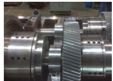
HC/CH clutches installed in drawworks gearbox.