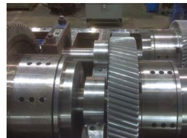
HC/CH clutches installed in drawworks gearbox.