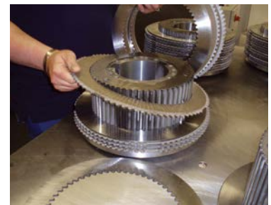
HC/CH clutches feature extra thick plates combined with high performance friction materials.

Most unique to this HC/CH clutch is the incorporation of the Patent Pending Key Seal . This innovation allows for the use of standard O-rings and improves the ease of installation in current configurations using a double keyway and single drilled actuation hole. This feature simplifies the sealing process and minimizes the possibility of damage to expensive seal arrangements. If seal damage with the Key Seal feature does occur, the seals can be repaired easily without the need to remove the clutch from the shaft in most applications.