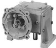
F/QC700C/D Page 38