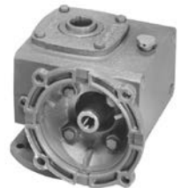
SF700V/W Page 43