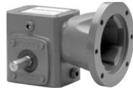
QC700 BASIC Page 34