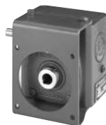
H700R/L Page 50