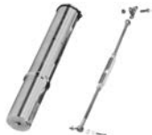
Shaft Kits/Reaction Rods Dimensions - Page 264