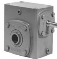
S700 Page 51