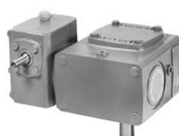
WC700 BASIC Page 97