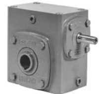
H700 Page 49