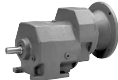
Triple Reduction Foot Mounted, Flange Input Dimensions-Page 187