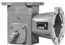
F/QC700BRB Page 37