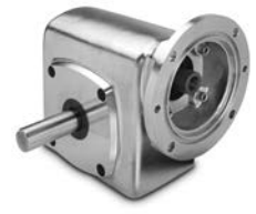
SSF/SSH 700 Page 53