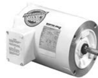
BostKleen™ / Stainless Pages 342