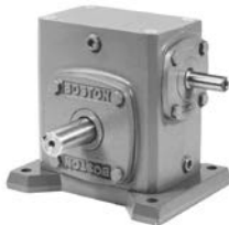
700B Page 45