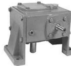
700C/D Page 47