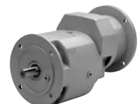
Triple Reduction Output Flange Mount, Flange Input Dimensions-Page 189