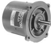
FSP Series Pages 329-332