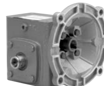
SF700 Page 42