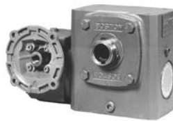
SFWA 700 BASIC Page 85