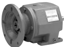
Double Reduction Foot Mounted, Flange Input Dimensions-Page 186