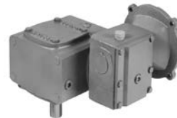
FWC/QCWC700 BASIC Page 87