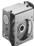
HF700R/L Page 41