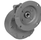
HMF Series Selection Pages 239 Dimensions - Page 245