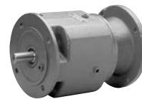
Double Reduction Output Flange Mount, Flange Input Dimensions-Page 188