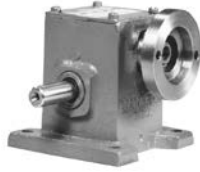
F309B Page 143