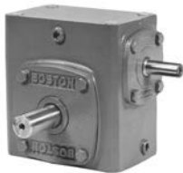
700 BASIC Page 44