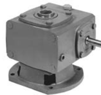
S700V/W Page 52