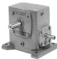
700A Page 46