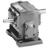
TW113A Page 148