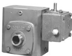
HWA OR HWC Page 92 & 98