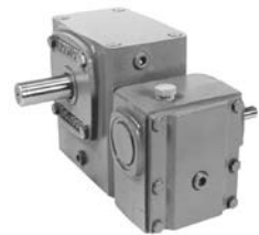
WA700 BASIC Page 92