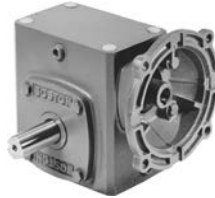
F700 BASIC Page 34