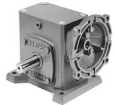
F/QC700B Pages 35