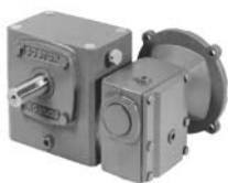
FWA/QCWA700 BASIC Page 82