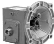
HF/HQC 700 Page 40