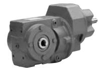
Triple Reduction Non-Flange Dimensions-Page 235