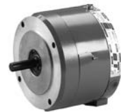
Double C-Face AC Brakes CMBA Series Pages 343