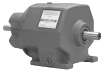
Double Reduction Foot Mounted Dimensions-Page 190