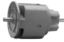
Double Reduction Output Flange Mount Dimensions-Page 192