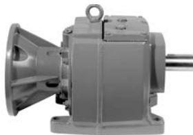
Double & Triple Reduction Foot Mounted, Flange Input Dimensions - Page 298