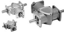
Right-90 Series Pages 305-308