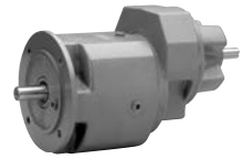
Triple Reduction Output Flange Mount Dimensions-Page 193