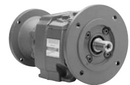
Double & Triple Reduction Output Flange Mounted Dimensions - Page 300