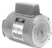
NEMA C-Face AC-Motors Pages 334-339