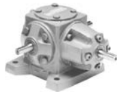
R100/R200 Series Horizontal Base Model Dimensions-Page 313