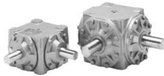
R1000 Series Pages 316-327