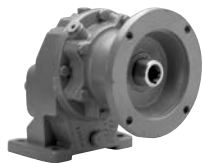
Single Reduction Foot Mounted, Flange Input Dimensions - Page 297