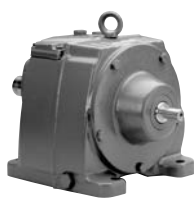
Double & Triple Reduction Foot Mounted Dimensions - Page 302