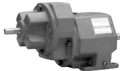
Triple Reduction Foot Mounted Dimensions-Page 191