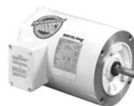
BostKleen™ / Stainless Pages 342