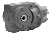
Double Reduction Non-Flange Dimensions-Page 234