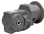
Triple Reduction Flange Dimensions-Page 233