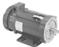
NEMA C-Face DC Motors Pages 340-341