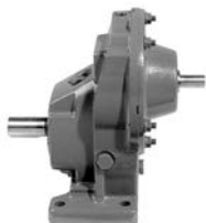
Single Reduction Foot Mounted Dimensions - Page 301