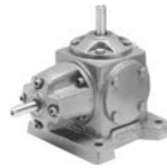
VR100/VR200 Series Vertical Base Model Dimensions-Page 313