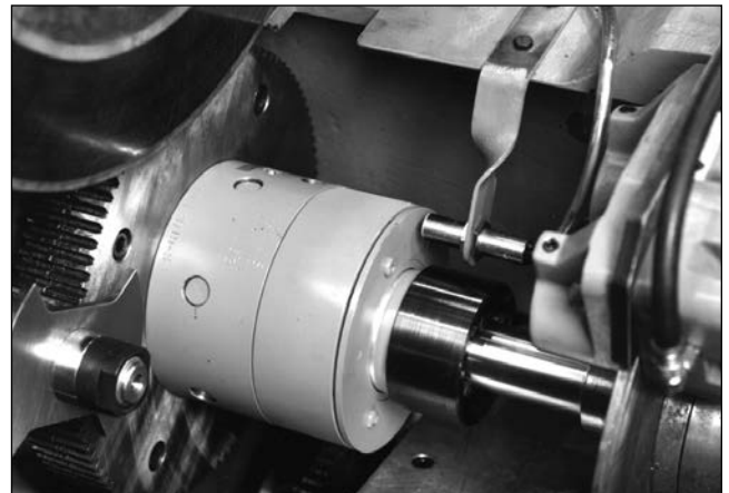
VariTorque Overload Clutch Paper Converting Machine