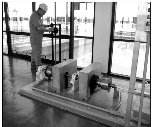
H1900 Overload Clutch Water Treatment Plant