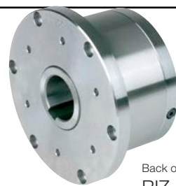
Back of RIZ..G1G2