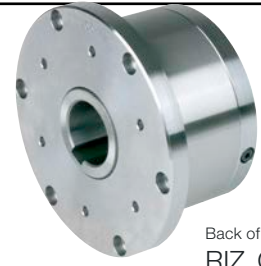
Back of RIZ..G1G2