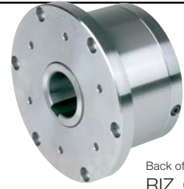
Back of RIZ..G1G2