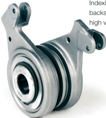
Indexing clutch and backstop combination for high voltage switch-gear