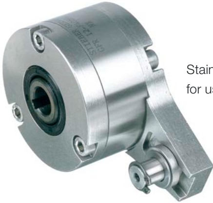
Stainless steel indexing clutch for use in the food processing industry