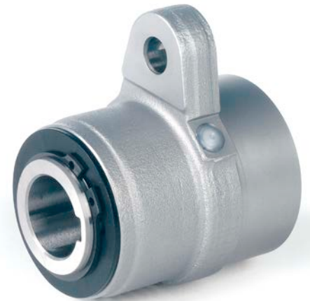
High performance indexing clutch for use on an offset printing machine