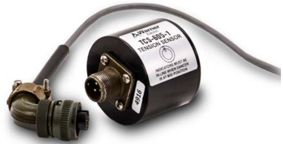
TCS-605 Pivot Point Sensor