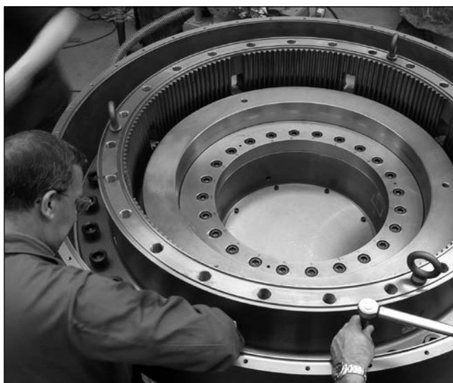
HBS 42 brake assembly

A network of service oriented, technically trained, authorized Wichita distributors will promptly serve your replacement part needs.