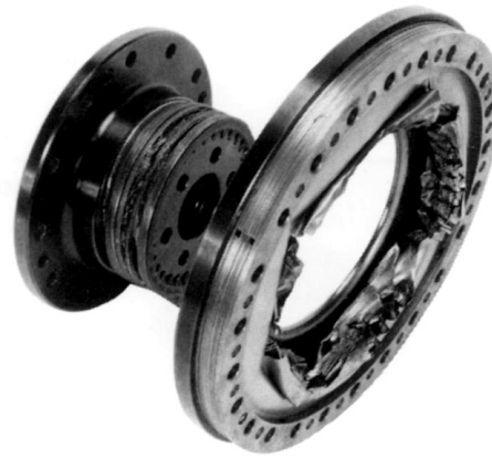
Figure 3: The diaphragms will shear from the spool preventing transfer of power.

Disc life analysis is complicated by fretting caused by coupling misalignment. Manufacturers typically calculate safety factors using the classical fatigue failure theories such as the modified Goodman diagram, but do not reduce the disc raw material endurance limit caused by corrosion fatigue, wear, or coatings. Published raw material endurance limits are not intended to consider wear with fatigue or the coating effects. Users should exercise caution when reviewing such data and consider the manufacturer's experience and disc life history for similar applications. Either a reduction of endurance properties or higher safety or service factors may be required. Some manufacturers may require a minimum service or application factor. A bolt fatigue analysis should be performed in high-torque applications due to the high bending stresses. This will ensure that the fatigue analysis is performed on the coupling's component with the lowest safety factor. Following these guidelines will help assure long disc coupling service life in typical high-performance turbomachinery.