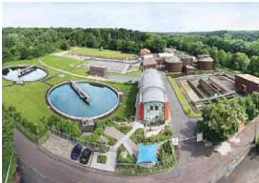
Water treatment plant located outside of Munich processes waste water from approximately 50,000 residents.

During the product's development it was clear that the new PMSM would offer customers impressive energy savings over conventional, inverter driven Asynchronous Motors (ASM). There has been a large amount of publicity recently about PM motors, but there is still reluctance in the market to buy them, as the purchase cost is higher than that of standard motors. In some light-duty applications, where the motor is rarely on, it is still more economical to specify a standard motor, but, if the duty cycle is high then a PM motor can quickly meet its ROI figure and then go on to deliver savings for a long time to come.