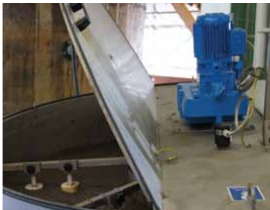
Bauer PMSM unit installed on disc thickener which is in continuous operation for seven hours a day, seven days a week.