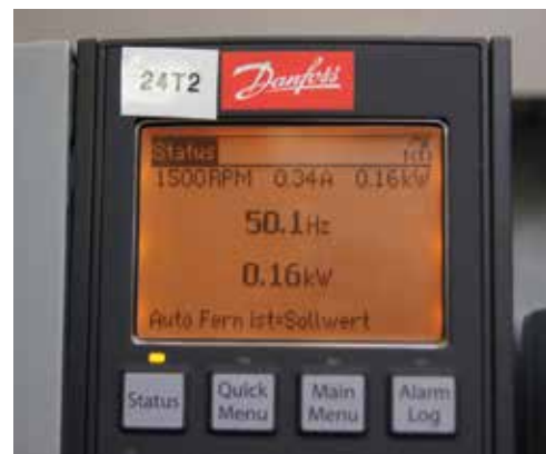
Bauer has developed relationships with many of the leading manufacturers of speed control solutions to work hand-in-hand with its products, maximising the efficiency of its solutions.