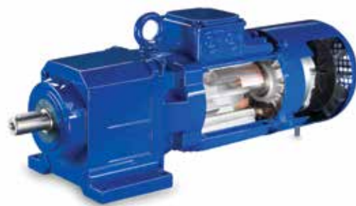
Not only does Bauer already conform to IE2 and IE3 classification, it is also leading the way in new IE4 technology.