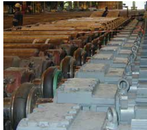
Bauer supplies electro-mechanical application solutions that guarantee every component is hand-picked for the application, and integrated as efficiently as possible.

Thanks to its completely modular design, Bauer's standard product range offers thousands of potential drivetrain packages while, for more specialized applications, the Bauer Specialist Serial Demand service can build a completely custom design which is integrated into the machine from the ground up. Its engineers work to maximise the potential energy savings at every stage of specification and installation to deliver the best possible solution for each individual application.