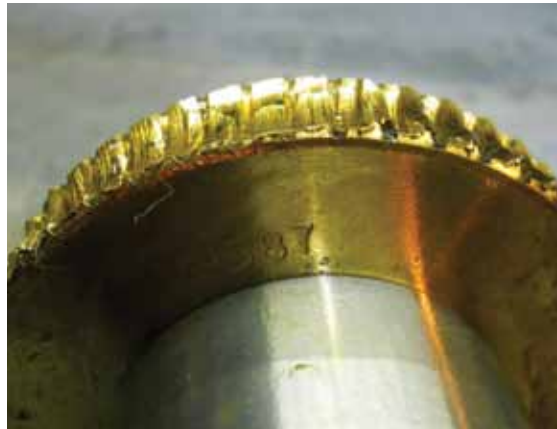
Figure 3: Worn gear teeth

The right angle worm gearbox is a common tool for reducing speed and/or magnifying torque in a wide array of applications. Ensuring that the gearbox is lubricated with the proper type and proper amount of lubrication are simple but important steps that maintenance staffs can take to help ensure the longest life from their installed gearboxes.