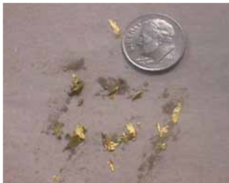
Figure 1: Bronze gear shavings

The right angle worm gearbox is a simple device that is used widely in manufacturing facilities. Like nearly all gears, enclosed worm gear drives require proper lubrication in the proper amounts. It is these two factors that are the most common cause of pre-mature failure in worm gearboxes. Lack of lubrication and use of incorrect lubrication are the two top causes of gearbox failure.