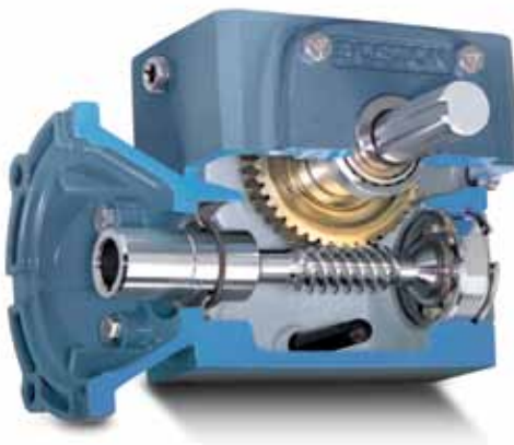
Figure 2: Worm-under mounting

A novice installer may ignore or neglect to read the tags, labels and installation manual warnings that indicate that there is no lubrication within the gearbox and start up a drivetrain with a gearbox that is empty of lubrication. Running a unit dry will rapidly cause damage to the bronze worm gear. In the photo left (Figure 1) can be seen bronze shavings that resulted from a unit run dry. Even if lubrication is added after the fact, this damage is permanent and the gearbox will have to be replaced or rebuilt. There is no way to ‘heal’ a damaged gear.