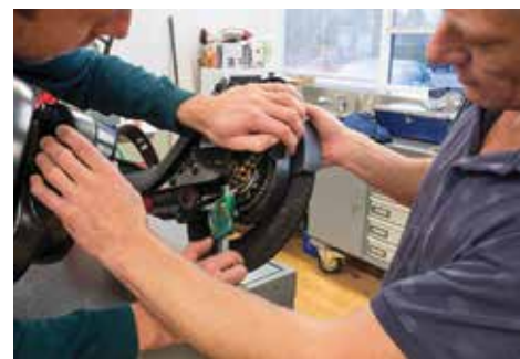
The Stieber CSK30 PP has a 133 lb.ft. (180 Nm) torque capacity and a 4,200 RPM maximum overrunning speed.