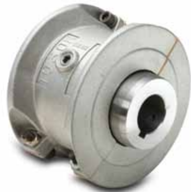
Fig. 2: TB Wood's G-Flex grid coupling with horizontal cover. This clamshell design, if improperly installed, could come apart under rotation.

It is tempting to believe that we are so precise in our muscle control that we know how to tighten fasteners to a specific value. Proper use of a torque wrench and attention to manufacturer's torque specifications can ensure a properly functioning, long-lasting and safe installation.