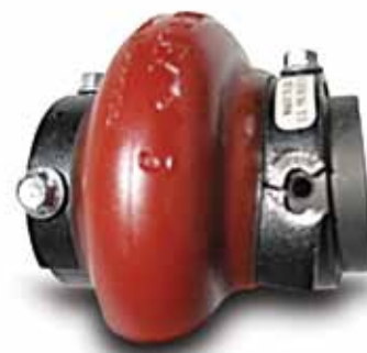
Fig. 3: Damaged TB Wood's Dura-Flex coupling due to over-tightened hub.