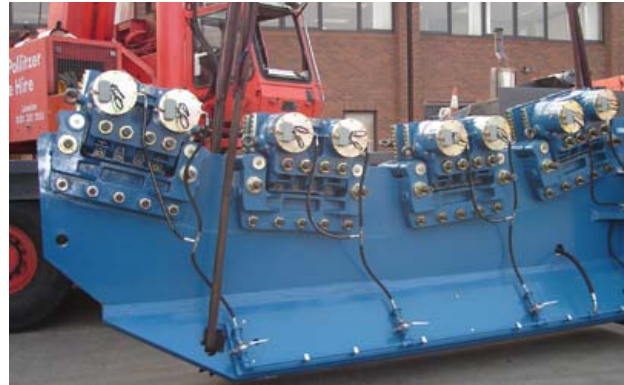
One of the two Brake Stations for Boliden Aitik mine shown loading at the UK factory. Each unit, when upright, measures 5.1m high and weighs approximately 15 tons.

Unlike the Mount Milligan project the Boliden system comprises eight-off VMS-DP calipers which generate nearly 40 MNm braking torque for each mill, acting on a 12.97m mill flange diameter.