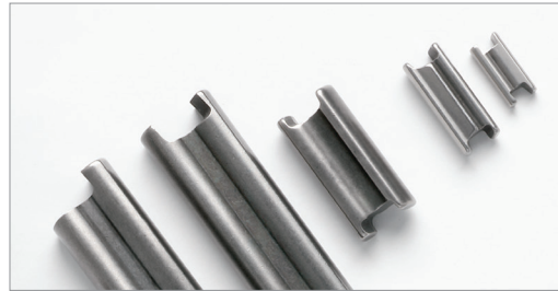
Formsprag manufactures a wide variety of sprag sizes and shapes to meet specific application requirements.

Other common applications include auto plant conveyors, punch presses, roller coasters and ski lifts.