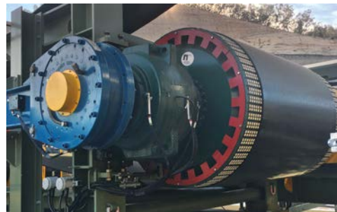
Dual RDBR 300 models with 70 kNm torque per unit are installed on the 3,050 m (1.9 mile) long drift conveyor at the Moolarben Coal Complex in Australia. The inclined conveyor transports coal from the longwall system underground to the surface and features an 80 m (262 ft.) lift and has a capacity of 4,500 tph.

The Stieber backstops were chosen to meet the tough conveyor application requirements due to their superior release functionality.