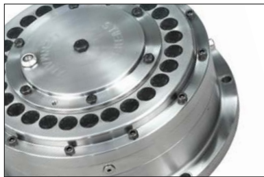
The Stieber Clutch RDBK high-speed releasable backstop with integrated torque limiter for load-sharing.

The Stieber RDBK is a centrifugal lift-off sprag type backstop with an internal torque limiter which is designed for use on the high-speed or intermediate shaft of the driving unit in multi-drive systems, such as on large inclined conveyors, where two or more backstops share the reverse load. These innovative backstops provide up to 3.5 times more torque capacity within the same volume and up to 15 times more energy dissipation than other conventional designs.