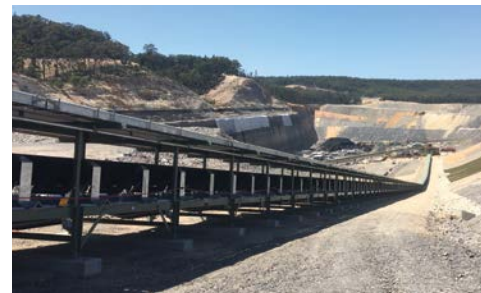
Twin RDBR 360 models with 120 kNm torque per unit are utilized on the ramp conveyor at the Moolarben coal mine.