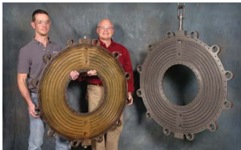
A new 36" composite water jacket (above, left) weighs approx. 95 lbs. A comparable 36" cast iron jacket (above, right) weighs approx. 375 lbs. The reduced weight is a significant maintenance and installation benefit in weight-restricted applications.

The composite material in the new water jackets was developed by Wichita engineers working with a partner firm who tested several polymer combinations before selecting the high-tech blend that satisfied the design requirement to be as strong as the original iron parts' typical design stresses. In fact, structural testing of the AquaMaKks 36-inch diameter composite water jacket resulted in zero failures even when the part was stressed to more than four times the maximum design load.