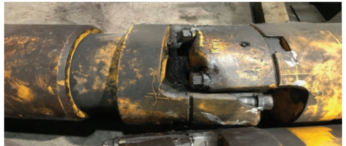
Damage due to bolts coming loose on competitor block-type U-Joint.