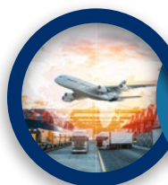
SIMPLIFIED SUPPLY CHAIN

Supply chain is a critical element of your business, and Regal Rexnord helps customers transition from multiple suppliers to ONE strategic partner . With local resources, reputable brands, and a proven history of delivering cost-efficient, high-performance solutions, Regal Rexnord is the global partner you need to solve your most critical challenges.