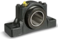
Sealmaster Mounted Tapered Roller Bearings