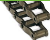
Rex Drive Chain