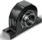
Rex™ SHURLOK™ Adapter Mount Spherical Roller Bearings