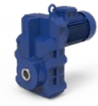
Bauer™ Gear Motor BF Series Shaft Mount Gear Motor