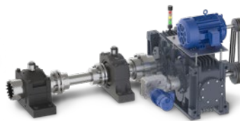
INDUSTRIAL POWERTRAIN SOLUTIONS