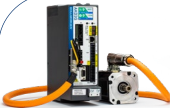
AUTOMATION & MOTION CONTROL