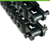
Link-Belt™ & Rex™ Engineered Steel Chain