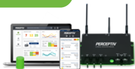
Perceptiv™ Condition Based Monitoring Systems