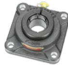
Sealmaster™ Mounted Ball Bearings