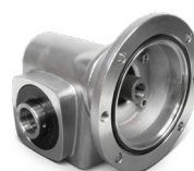
Boston Gear SS700 Series Stainless Steel Worm Gearbox