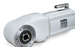
Bauer™ BK Series Epoxy Coated Helical Bevel Gear Motors