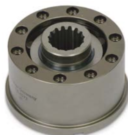
Overrunning clutch for multiple drive applications in construction machinery