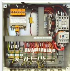
K-PR Premium Electrical Unit