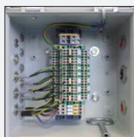
K-TB Terminal Box -1 10 inputs/outputs -2 20 inputs/outputs