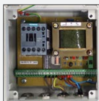
K-BA Basic Electrical Unit