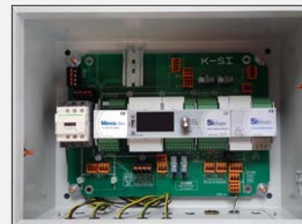
K-SI Electrical Unit with Siman