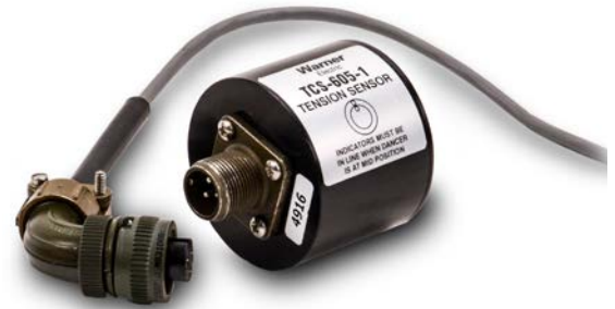
TCS-605 Pivot Point Sensor