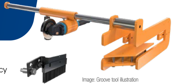
Image: Groove tool illustration purpose only, not exact model.

To help independent service providers (ISPs) as well as original equipment manufacturers (OEMs), Svendborg Brakes, a global expert in braking technology and part of Regal Rexnord Corporation, has completed an in-depth analysis of the issue. The outcome has been a innovation that delivers a long-lasting solution that can be employed by Svendborg Brakes engineers or those working for ISPs.